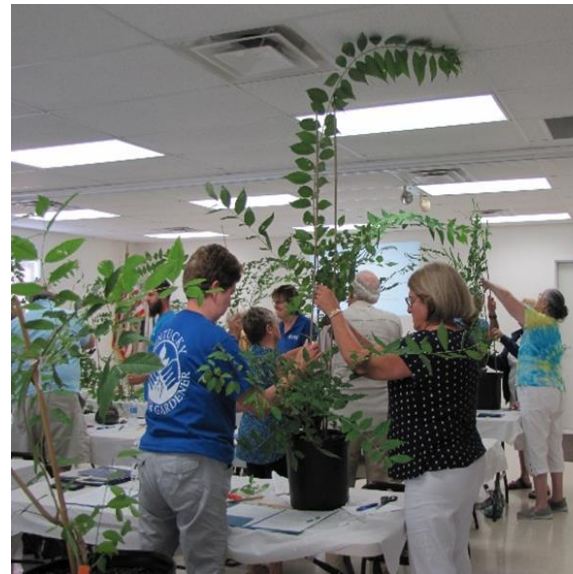
Figure 7. Master Gardeners advanced training pruning workshop.

Laboratory Tour. A total of 24 master gardeners from 5 counties attended the event that was classified as very good for most of them.