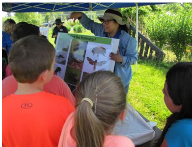
Figure 2. Pollinators are more than Monarch butterflies and honeybees.