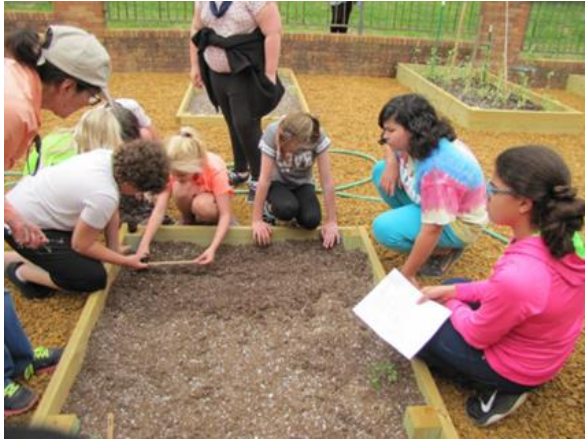
Figure 3. Students planting raised at beds LCES.