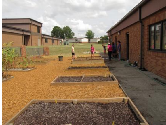
Figure 4. Multiple raised beds at the LCES.