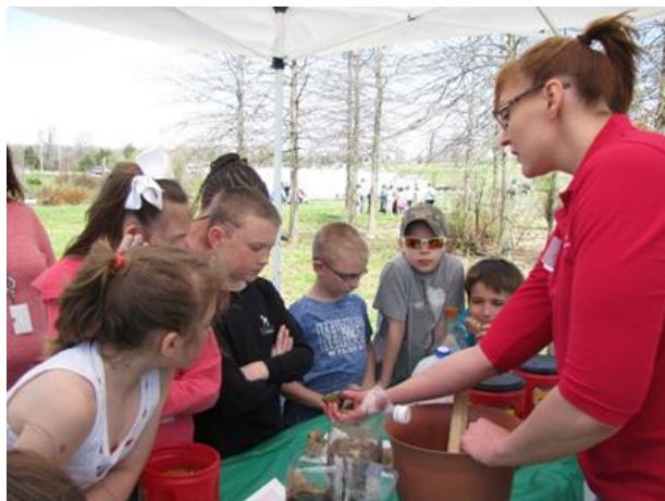
Figure 1. Earthworms for vermicomposting.